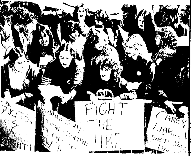
Student leaders hope for a better turnout at the upcoming rally than the dismal showing at the last one.