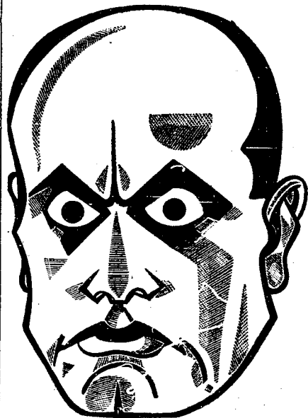
MAITRE'DE of Ego Luciano's new Olympic restaurant greets all guests with a happy smile.

Unfortunately the restaurant will be located in Rome, Italy. But buses will be supplied by the Olympic Transportation Company.