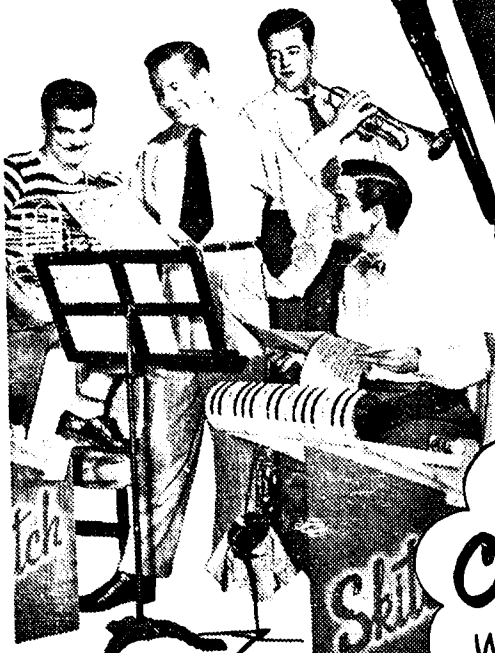
"Skitch" and some of his side-men looking over an arrangement of "Dancing With a Deb."

—"Skitch" Henderson's Newest Disc for Capitol