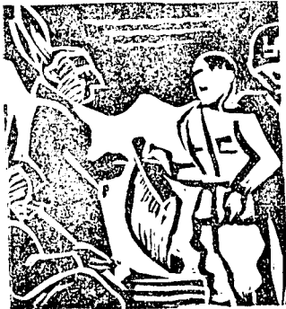
First photos of the Fuehrer giving Manhattan Island back to Chief Millerofsky.

In return for the isle, the Chief gave the Fuehrer sixteen strings of orange beads, and two lacrosse sticks. While the Chief smoked his pipe of peace, Hitler offered him his hand in a friend-