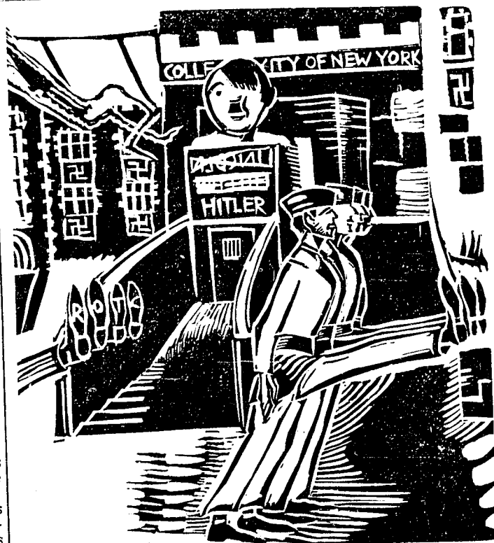
"Hitler's Children" on parade, pass the Fuehrer's statue in front of the Main Building.