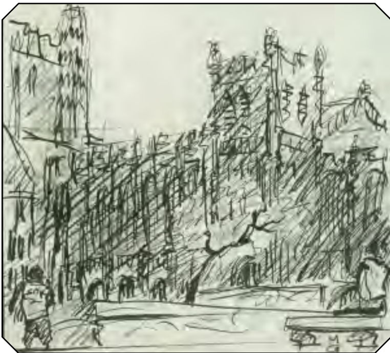
Students with CCNY Jacket across from Great Hall, one of the pen & ink Sketches in CCNY - an Era sketched in Time: The Drawings of Marvin Gettleman, Class of 1957, a library Archives exhibit which ran through October.