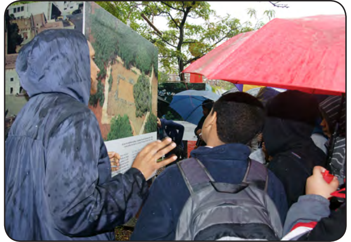
The tour goes on even in the rain.

The President of the Dominican Republic, Dr. Leonel Fernández Reyna, was a special visitor to the exhibit. He also toured the CUNY DSI Archives and Library at CCNY on September 20. This was the first time that President Reyna visited the now