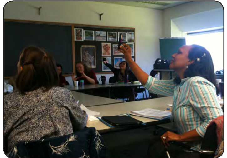
Learning more about QR (Quick Response) coding at the library's Professional Development Day (PDD)