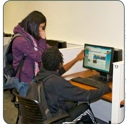
CCNY Office of Communications and Marketing

prepared to lead the way in their chosen fields. The facility doubles our capacity of available computers for general lab purposes. Additionally, software packages beyond the standard office productivity packages are available to help students complete class assignments and practice with tools that they will continue to use in their careers after college.