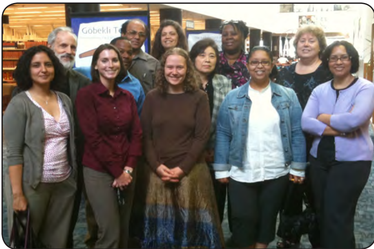
Library faculty & staff getting ready for their yearbook photo