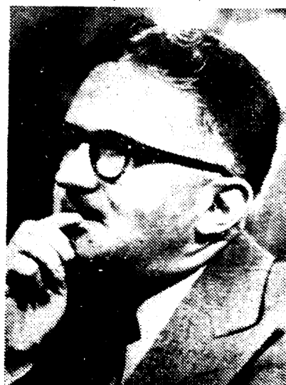
Carl Braden Civil Rights Leader

ference (AEPAC), stated that of those who are employed in the south, the poor living standard