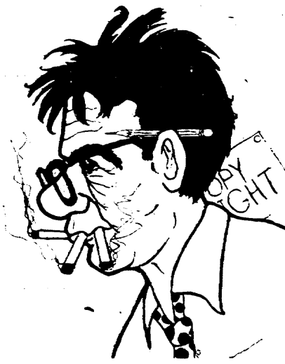
The Smoker Walk Or Smoke?