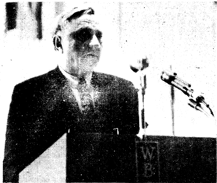
Supreme Court Justice Douglas, above, who will speak here next week, has been shifted from the Great Hall to the Grand Ballroom.