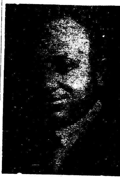
Jacob K. Javits Outlines Six Point Plan

to insure future prosperity of the buildings, office buildings and