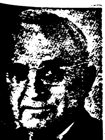
Pres. Truman Seen as Help

These figures give Stevenson 24% and Eisenhower 15.4% of