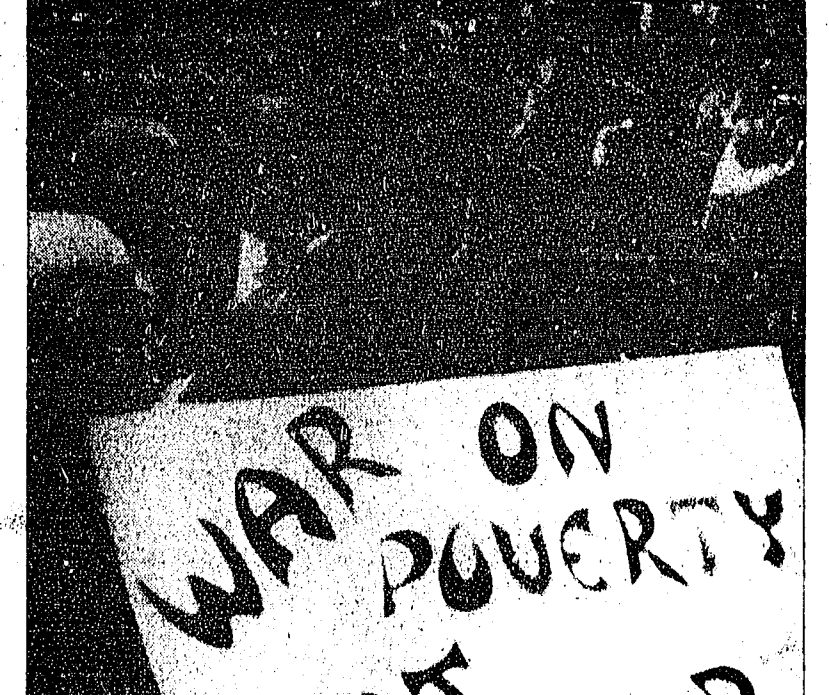
The Paper / Bernard Hines "War on Poverty"

needs of the people seems to have become neglected. The extent of the damage done can only be measured in terms of the peoples interest or disin-