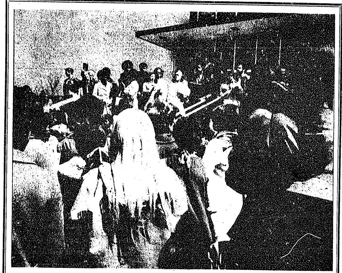
1970 rally protesting SEEK cuts. Will his tory repeat itself? See editorial on page 4.