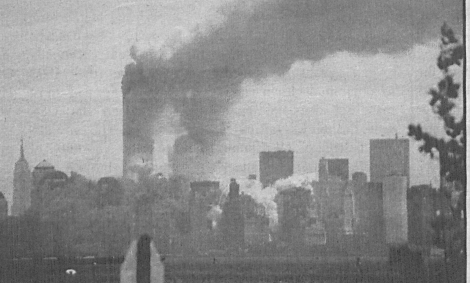
The WTC South Tower goes down Photo

Indeed, the city was humbled on September 11th. The Big Apple became gray with dust and debris, steel, bricks, glass, metal, and dead bodies. "It stinks down there," said one worker, while the smoke continues.