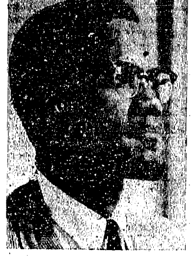
The late Malcolm X

This past November ten students were arrested on campus following an extensive period