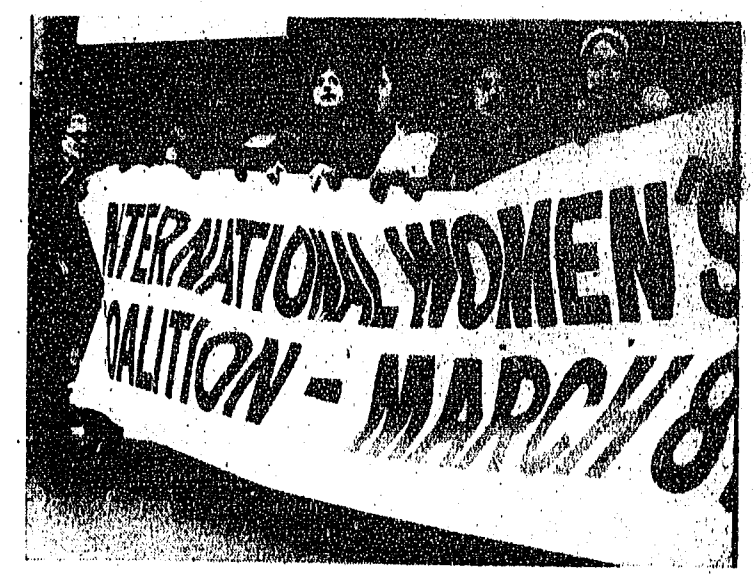
The Paper/Phil Emanuel Women march on U.N. to proclaim International Women's Day. (See pg. 2)

Ms. Rony, who is herself a (Continued on Page 3)