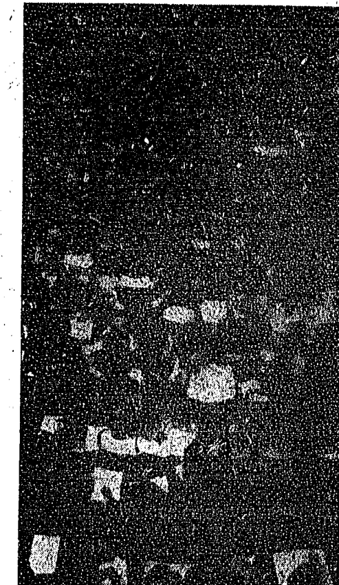
The Paper/Robert Knight