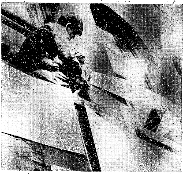
Overlooking site of PRSU takeover (Downer 104).