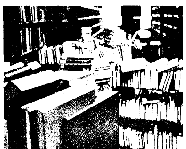
Photo by W. Kwang Been woking for "Henry A, Wallace: Quixotic Crusade 1948?" Maybe it's on one of these carts of unshelved books in the Cohen Library.

shrinking and new book costs have more than doubled in the last ten years. "We haven't done an inventory, but we know a lot of stiff disappears," confessed Cesario. The last inventory was done in 1957, when the main collection was moved to Cohen from the building which formerly stood on the site of the present Steinman Hall. Creating and maintaining references in the various catalogs and binding various technical reports and pamphlets have fallen seriously behind. The physical deterioration of the collection is virtually unchecked, and the crucial area of book conservation and mending has fallen years behind.