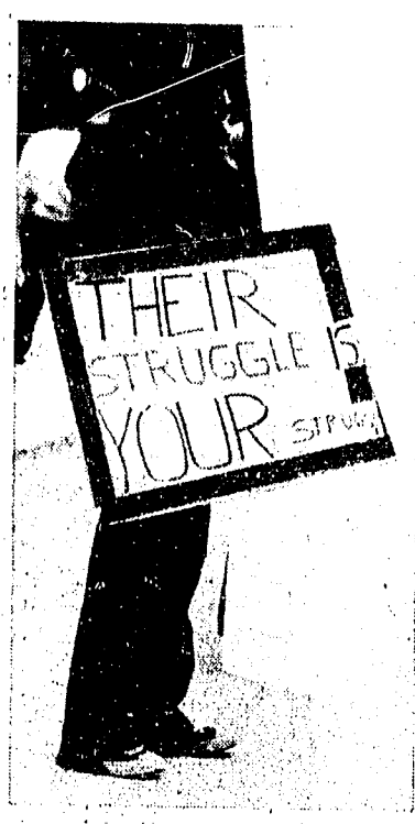
The Paper/Ronald Gray Black student holds sign of the times.

by Rafaela Travesier with Theodore R. Fleming