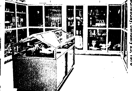
Photos of the Shepard Hall catacombs, Medieval and Renaissance Studies furnishings and tapestries and the Vertebrate Museum.